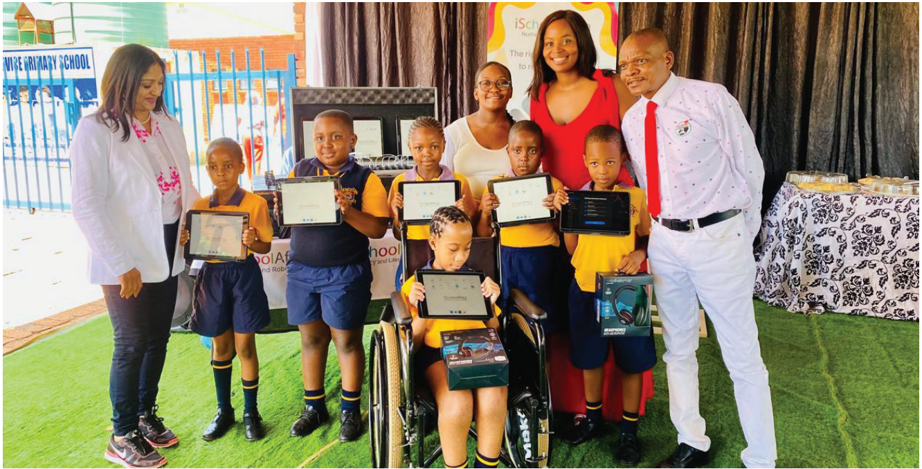
ITC iPad programme hand-over at Eureka Full-service school

iSchool Africa brings top-notch technology and classroom practices to township, rural, and inclusive schools, transforming teaching and learning. Over the past 11 years, we have supported 26 schools with Pad labs worth R450,000, improving education and skills in these communities.