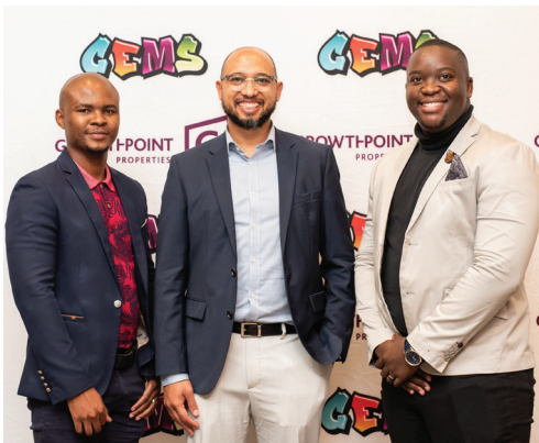
The GEMS team

Three pillar approaches: GEMS is anchored on a three-pillar approach of i)Academic support, ii)psychosocial support, and iii)personal & Leadership development. This approach enables us to provide 360 wrap-around support to ensure we develop holistic and well-rounded young people. This has enabled some students to discover gifts they weren't utilising, such as public speaking, animation/drawing, rugby, and interest in different career paths, among other elements. Moreover, some students have been able to access support that helped them deal with trauma from their past, such as sexual harassment, neglect, various mental health issues, etc.