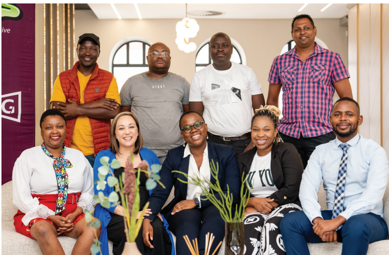
KZN Parents workshop 2024