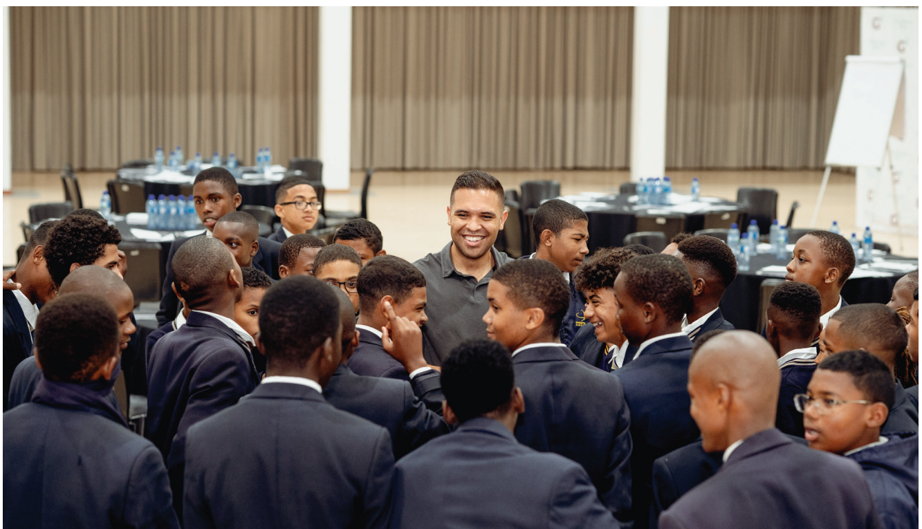
Build Our Boys Initiative 2022