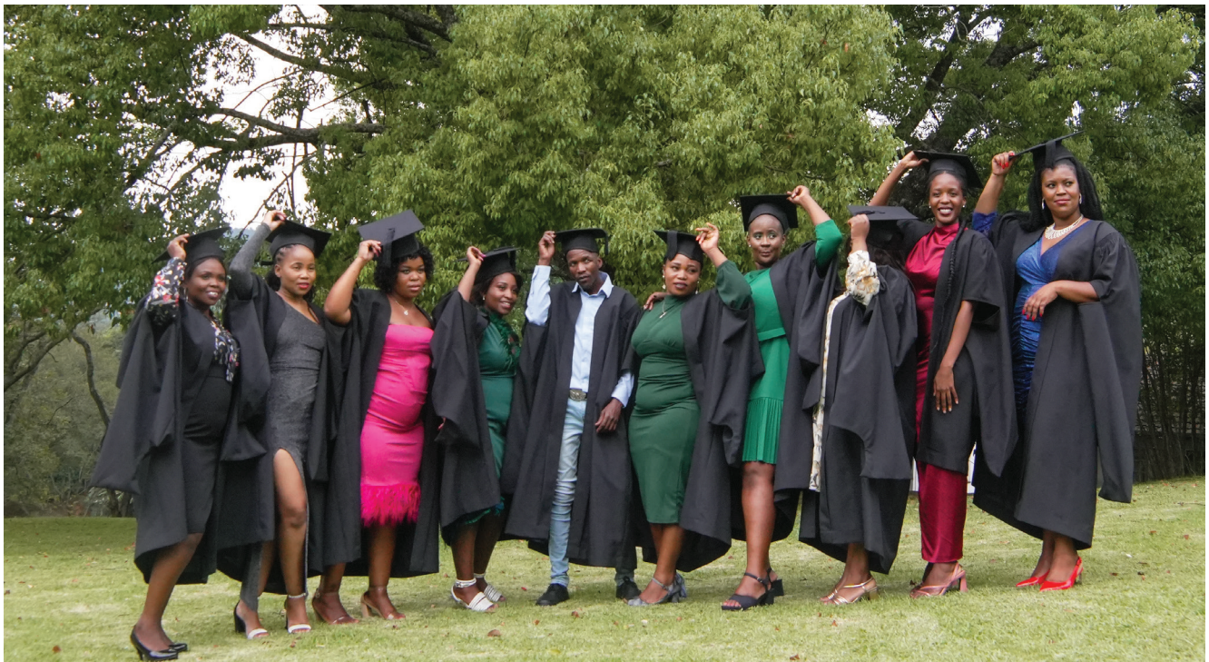
Alladin Learning Solutions Graduation 2023