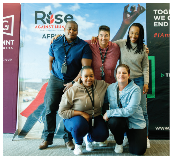
Rise Against Hunger food packing event