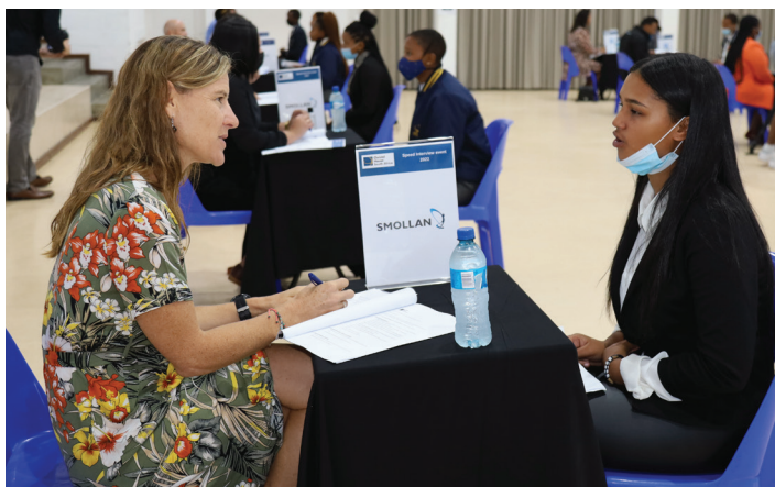
Christel House Speed Interview