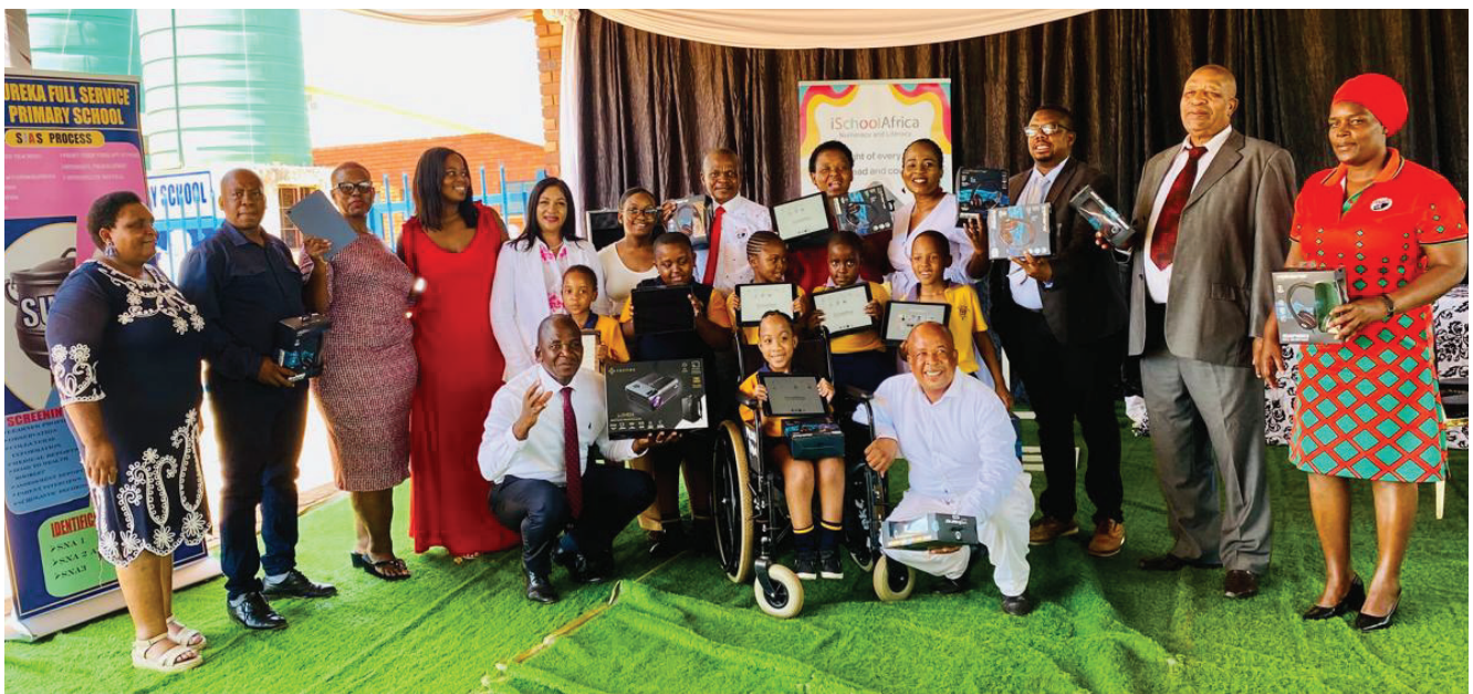
ITC iPad programme hand-over at Eureka Full-service school