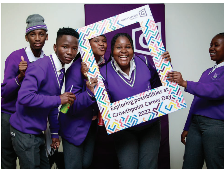
67 Minutes for Nelson Mandela Career Day event